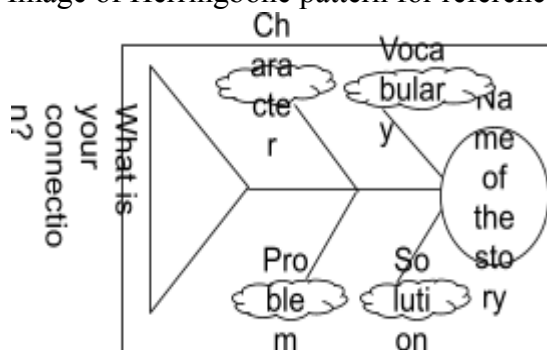
Image of Herringbone pattern for reference.

After reading the books, prepare your herringbone patterns of your favorite story.